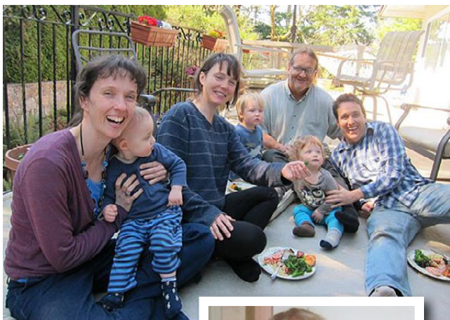
Our wonderful family, minus Isla who hadn't arrived