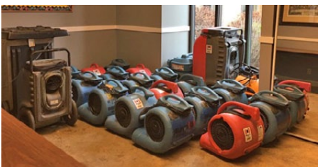
Some of the equipment used to dry out the church

Peter our Rector was at the church within the hour, helping to move