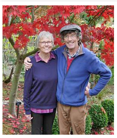
Love still blossoms after 42 years!