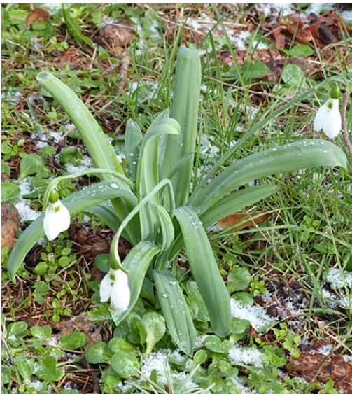
Snowdrops after the recent snow