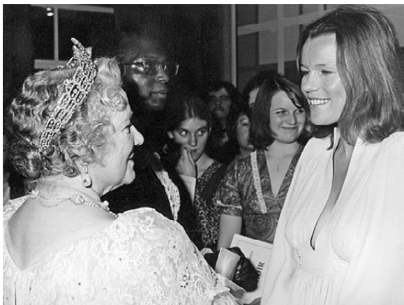
'Me and my Mom'