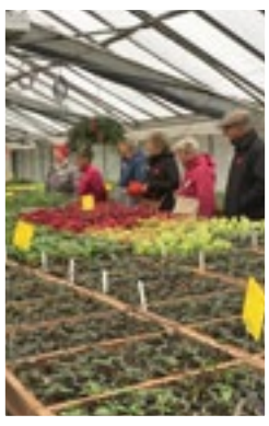
The Butchart Gardens tour