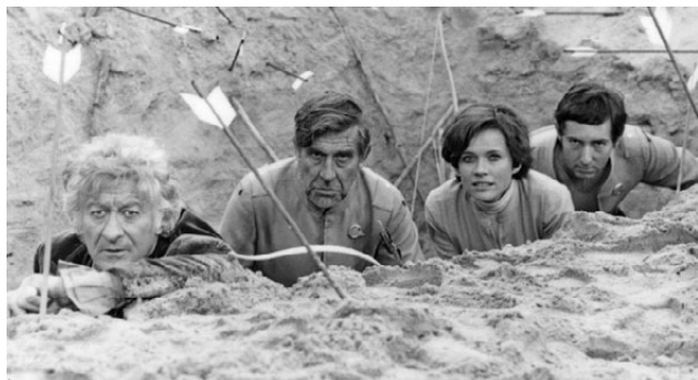
My father warned me that acting is not a safe profession