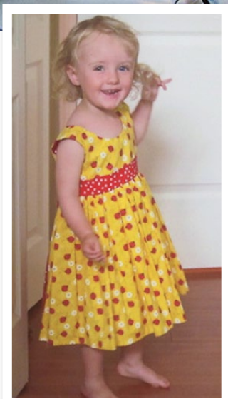
Here I am! Isla aged three