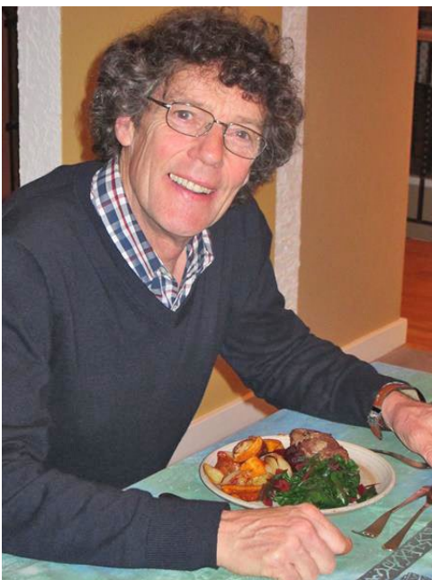
Food glorious food