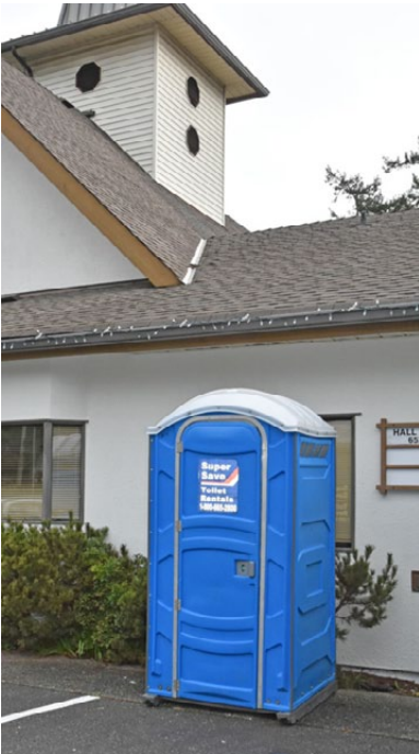
The Angli-Can or The Peter Potty?

“Many thanks to everyone who helped out, in so many ways.”