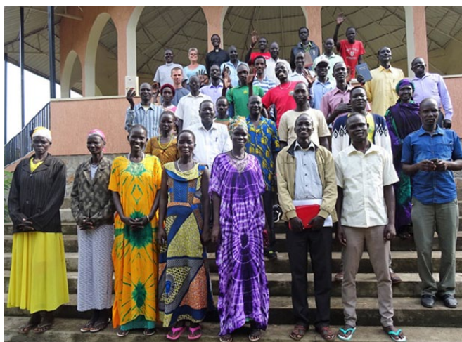
Students and staff at St. Frumetius' Theological College, Gambella, Ethiopia, in July, 2017