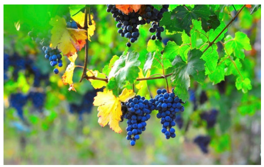
APRIL 28, 2024 – EASTER 5

Those who wait for the Lord shall renew their strength, they shall mount up with wings like eagles, they shall run and not be weary, they shall walk and not faint. Isaiah 40:31