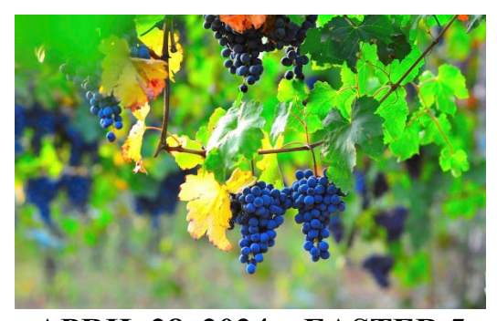
APRIL 28, 2024 – EASTER 5

Those who wait for the Lord shall renew their strength, they shall mount up with wings like eagles, they shall run and not be weary, they shall walk and not faint. Isaiah 40:31